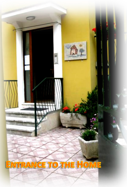
ENTRANCE TO THE HOME