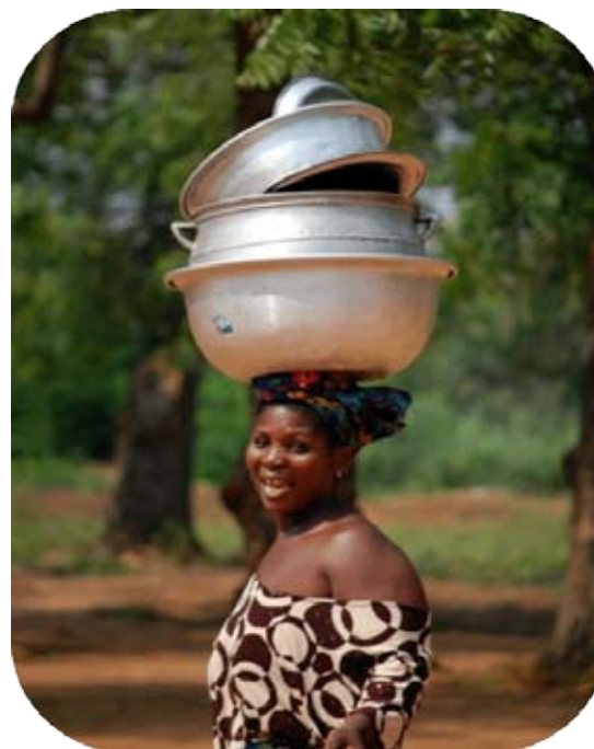
The smile of gratitude for the reborn life!