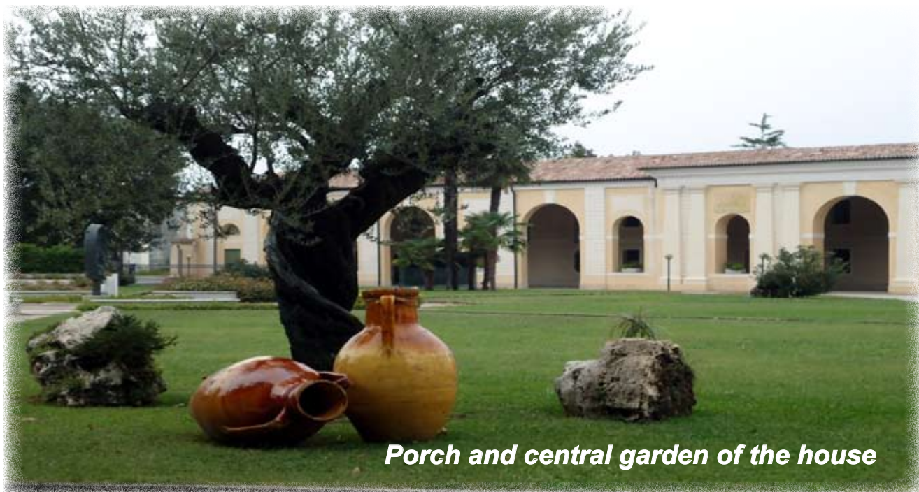
Porch and central garden of the house

We would like that this be a house open to the Providence where the persons can find friendship, comfort, and may be even help in their difficulties.