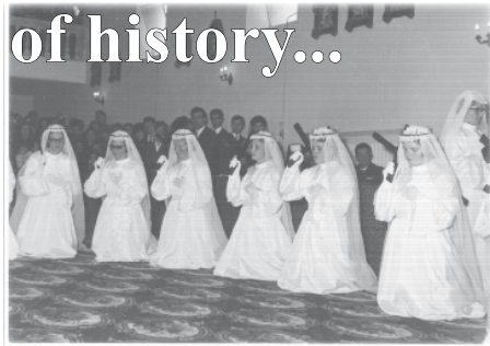
Ancient ritual of entrance to the Novitiate of new candidates